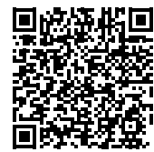
First Nations People